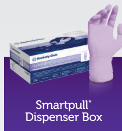
Smartpull* Dispenser Box